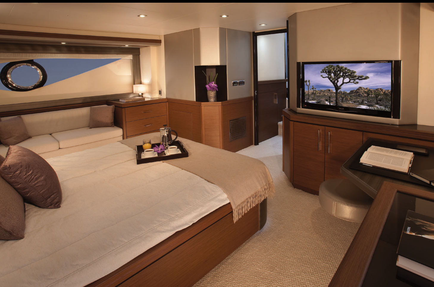
Master Stateroom — These spacious accommodations incorporate an island queen-size bed with innerspring pillowtop mattress and under-berth storage, a desk and computer workstation, a walk-in closet and plenty of drawer, cabinet and shelf space for optimum cruising comfort and convenience.