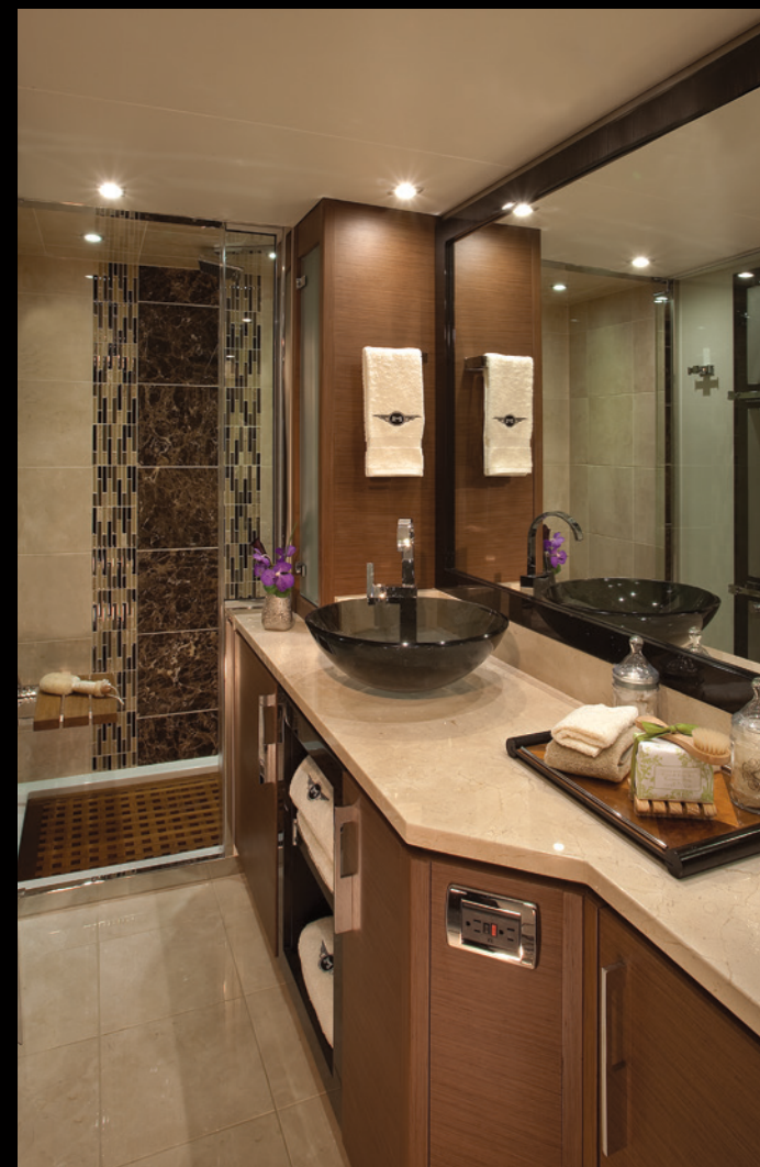
Master Head — The large master head features marble flooring, cabinets with satin walnut finish, solid walnut door, stone countertop and backsplash, elegant vessel sink, and walk-in tiled shower.