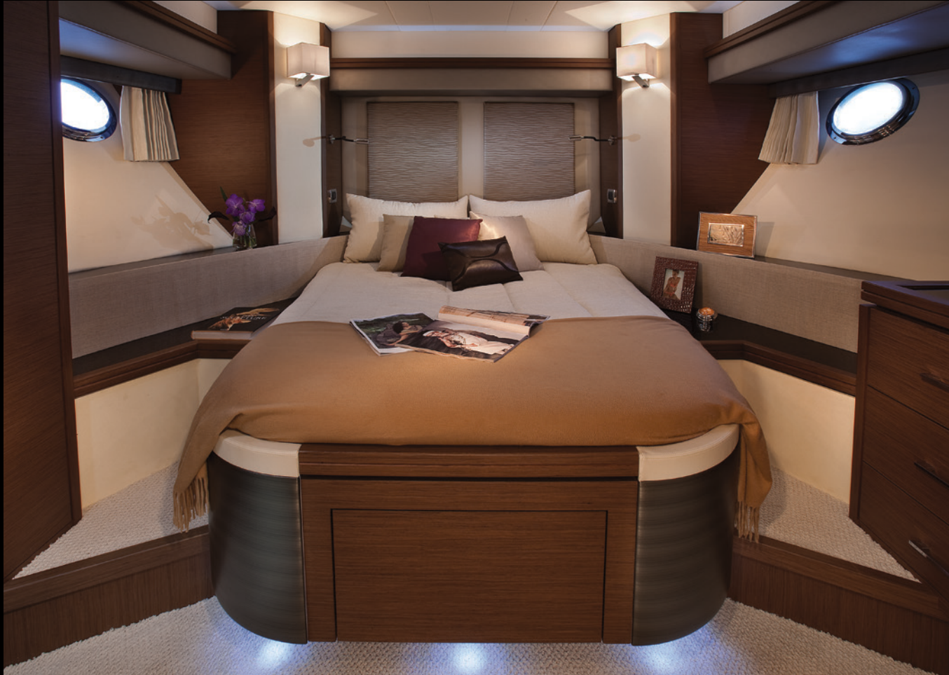
VIP Stateroom — The 660's well-appointed VIP stateroom includes a step-up island queen-size bed with innerspring pillowtop mattress and plenty of storage, all bathed in natural light courtesy of the large overhead hatch. The 660 also features a twin-berth guest stateroom, and both guest accommodations have private access to the guest head.