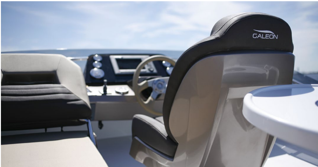
A second steering station on the flybridge