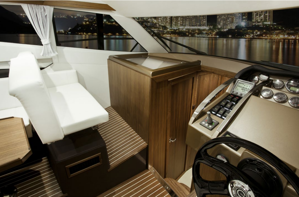
The seat can be turned to face both ways