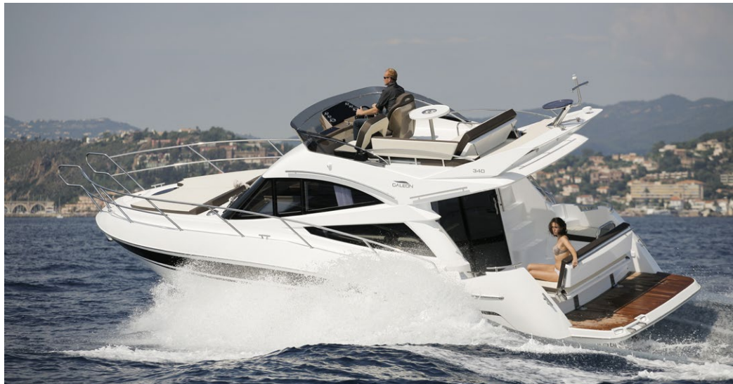
Cockpit seating can be turned into a sundeck