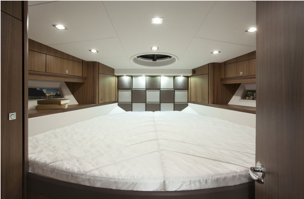
Bow owner's cabin