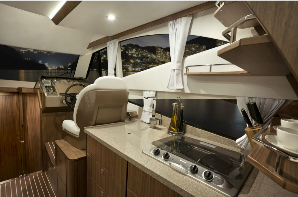
The galley is well suited for preparing meals