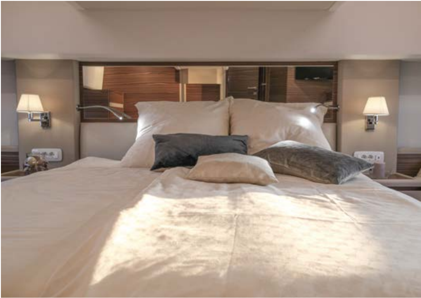
Full beam master cabin mid ship