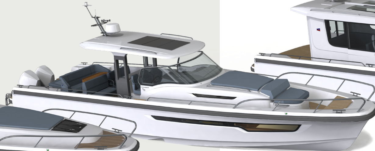
NIMBUS T11 SPRING 2019